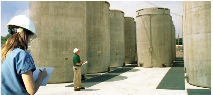
After the cooling period, nuclear energy facilities store used fuel safely on-site in steel and concrete vaults.