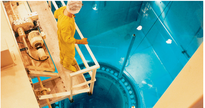
Used fuel at nuclear energy facilities is cooled in secure steel-lined concrete pools filled with water.