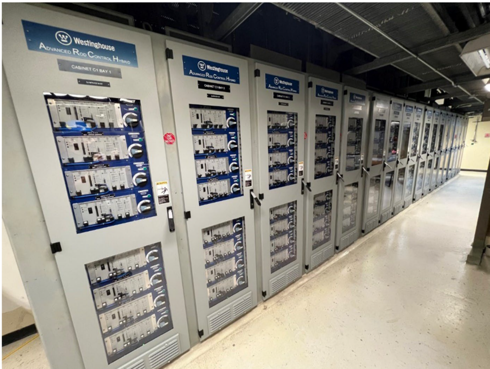
Figure 1 – Palo Verde Unit 3 ARCH Installation