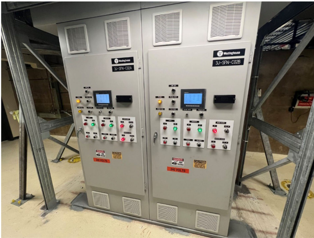
Figure 3 – Palo Verde Unit 3 Rod Control Operations Display